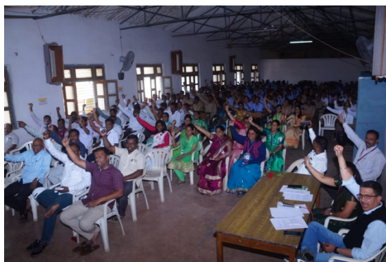
Students. Teaching and non teaching staff present for the session.